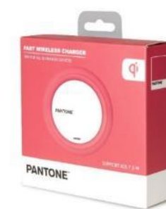
Wireless charger Output 7.5W