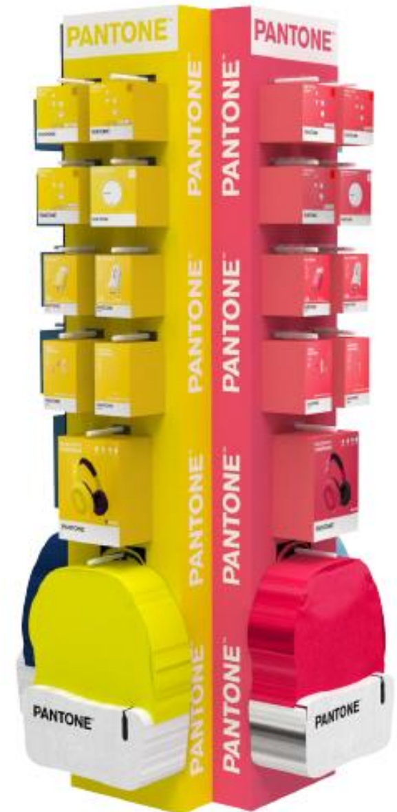
SPECIAL PROJECTS DISPLAY