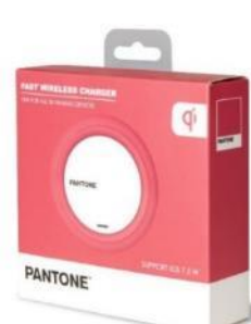
Wireless charger Output 7.5W