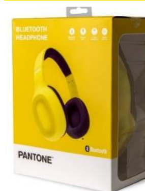
Bluetooth stereo headphones