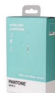
Bluetooth stereo headset