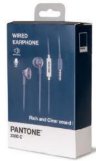
Wired Earphones (3.5mm jack)