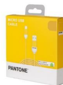
USB Cable Lightning MicroUsb Type-C