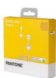
USB Cable Lightning MicroUsb Type-C