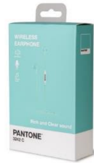
Bluetooth stereo headset