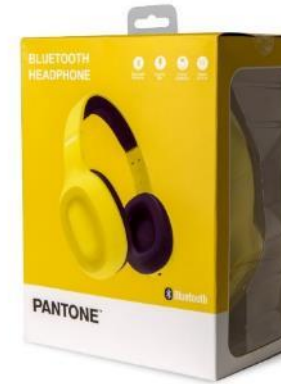
Bluetooth stereo headphones