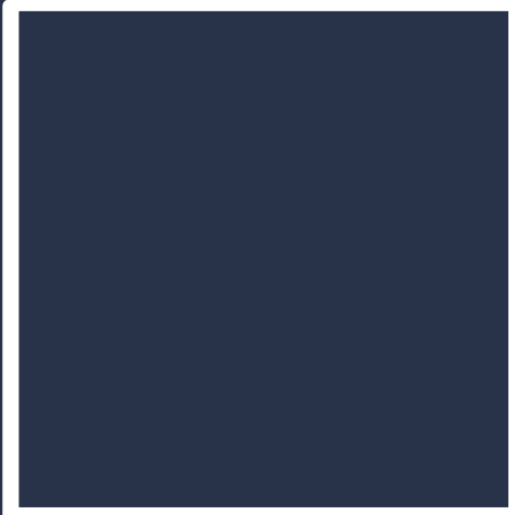
PANTONE 2380 C