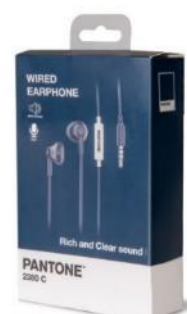
Wired Earphones (3.5mm jack)