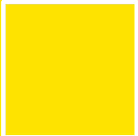
PANTONE 102 C